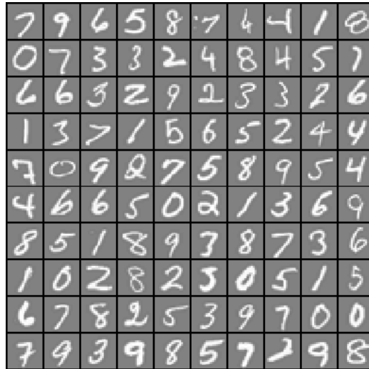
Figure 1: Examples from the dataset

20 pixel by 20 pixel grayscale image of the digit. Each pixel is represented by a floating point number indicating the grayscale intensity at that location. The 20 by 20 grid of pixels is “unrolled” into a 400-dimensional vector. Each of these training examples becomes a single row in our data matrix X . This gives us a 5000 by 400 matrix X where every row is a training example for a handwritten digit image.